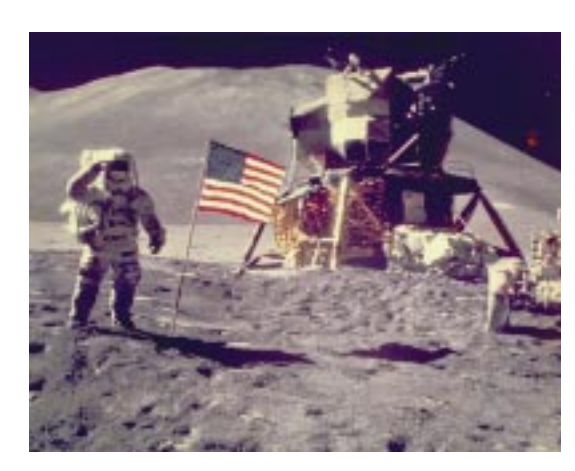
Curtis hour meters were used by NASA in the Apollo project to monitor all major electronic systems. More than 40 Curtis hour meters were installed in the space vehicles- and over 20 are still on the moon today, left behind on the moon with the descent module.